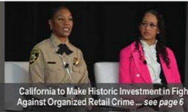
California to Make Historic Investment in Fight Against Organized Retail Crime ... see page 6