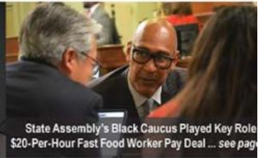
State Assembly's Black Caucus Played Key Role $20-Per-Hour Fast Food Worker Pay Deal ... see page 8