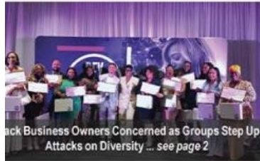
Black Business Owners Concerned as Groups Step Up Attacks on Diversity ... see page 2